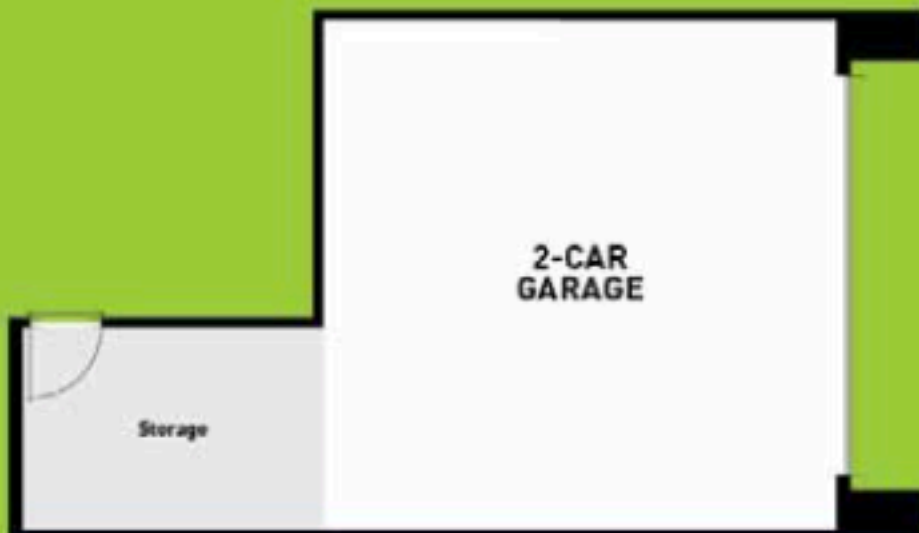
Garage for 3rd Floor