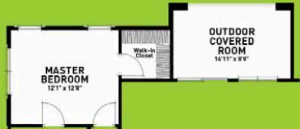
Master Walk-In Closet and Covered Outdoor Room at 5 Plex