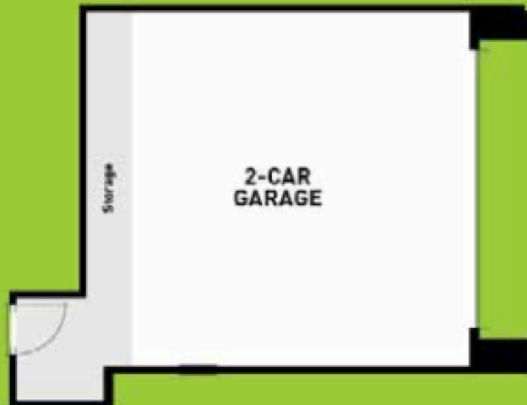
Garage for 2nd Floor